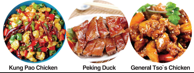
Kung Pao Chicken Peking Duck General Tso's Chicken